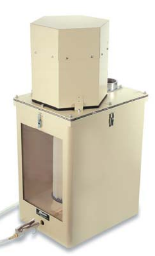
DustClear w/ Motor & Silencer