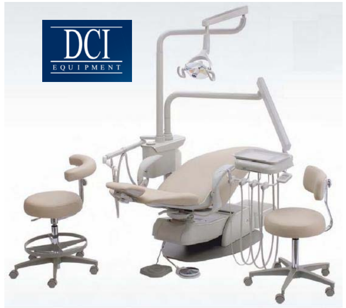
Alliance Ensemble Dental Operatory Package

QD water connection with flow control, QD air connection