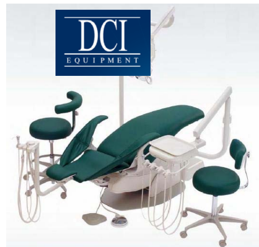
Alliance Swing Mount Ensemble Operatory Package

Input voltage 110V or 220V, Coordinated leg rest tilt