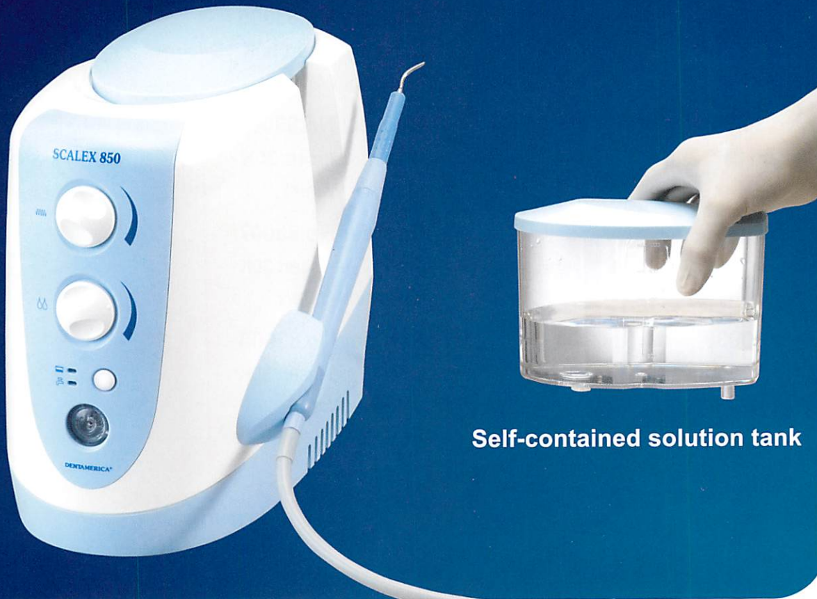
Self-contained solution tank