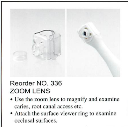
Reorder NO. 336 ZOOM LENS

HIGHLY FLEXIBLE CABLE ( NO FRAGILE FIBER OPTIC CABLE ) SINGLE PLUG MAKES CAMERA PORTABLE AND MOBILE